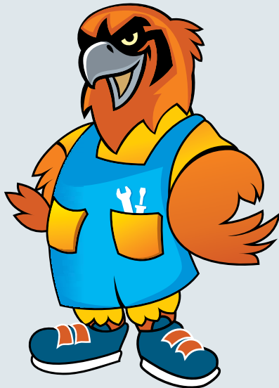
Indra - The Falcon

NYPUNYAM International Skill Summit & Skill Fiesta | 5-7, February 2016, Thiruvananthapuram, Kerala.